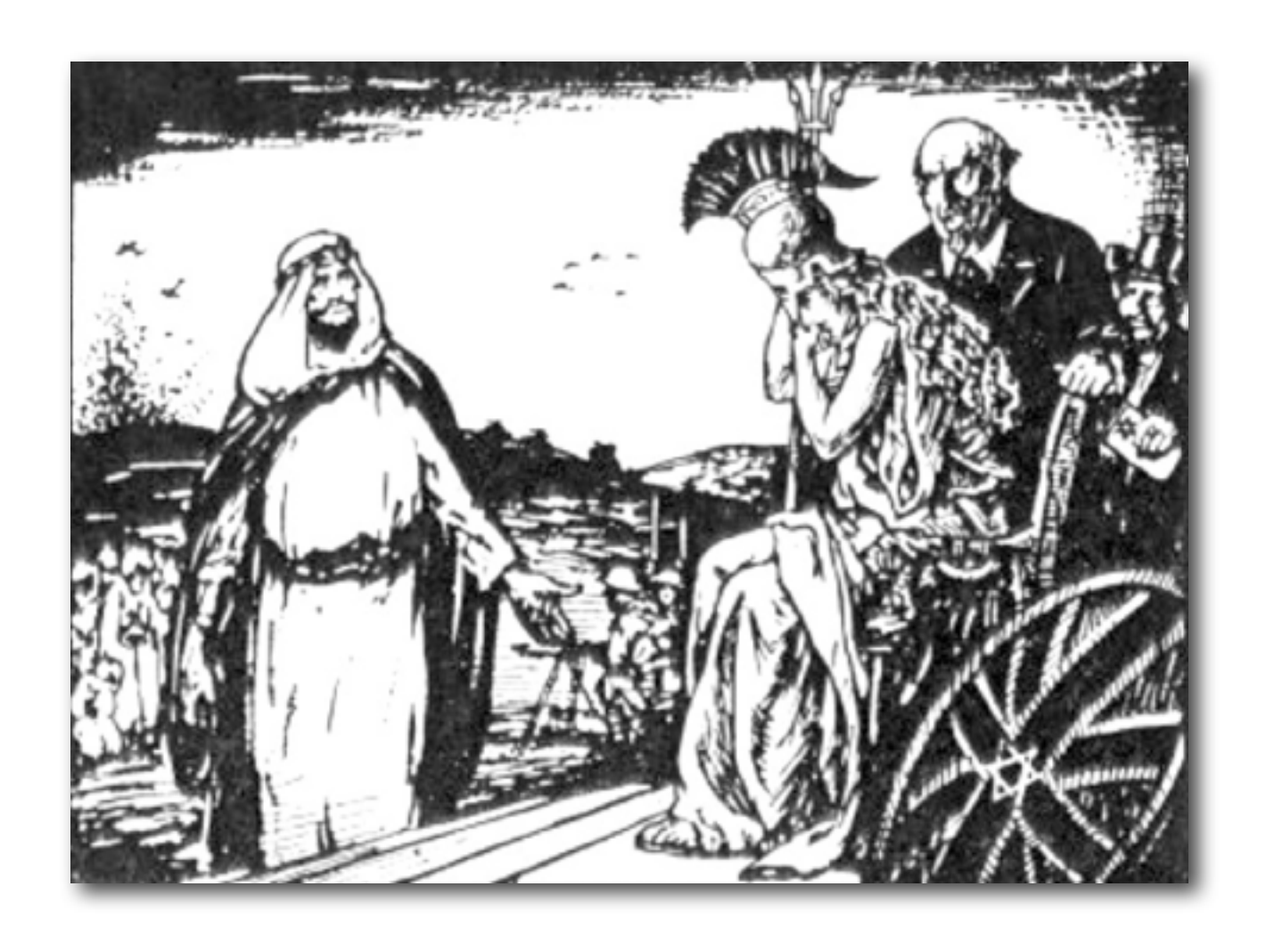
"We want only your native justice that our fathers taught us to trust."