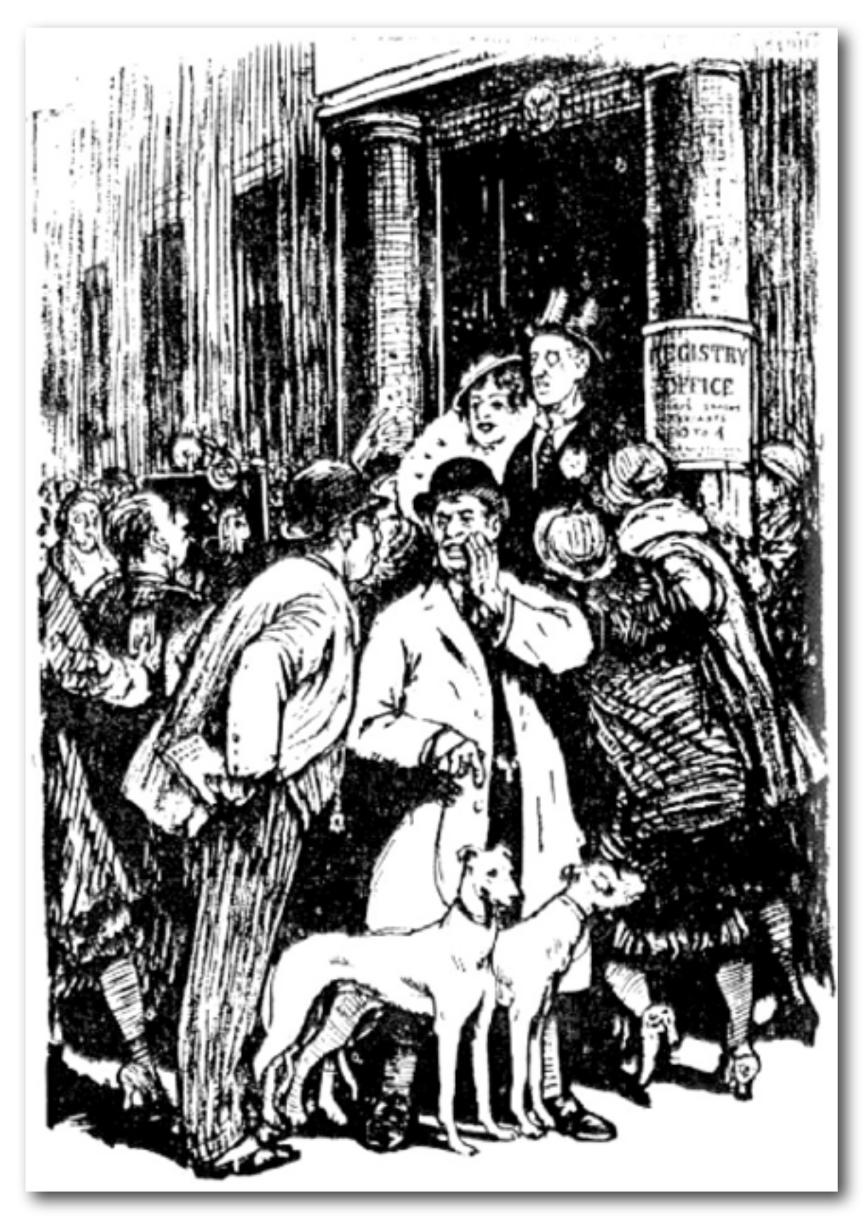
ASSIMILATION: "We dogs let our dogs do that."

A newly married couple, a Jewess and a Gentile, exiting the Registry Office is mocked by the dog owner for race mixing.