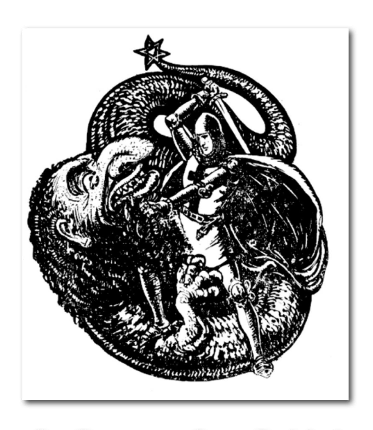
St George, Our Guide!