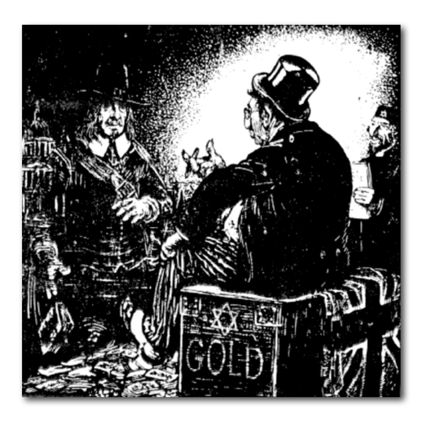
"Thanks to You I am the Sole Protector of the Common Wealth."

[Cromwell allowed the Jews to return to Britain.]