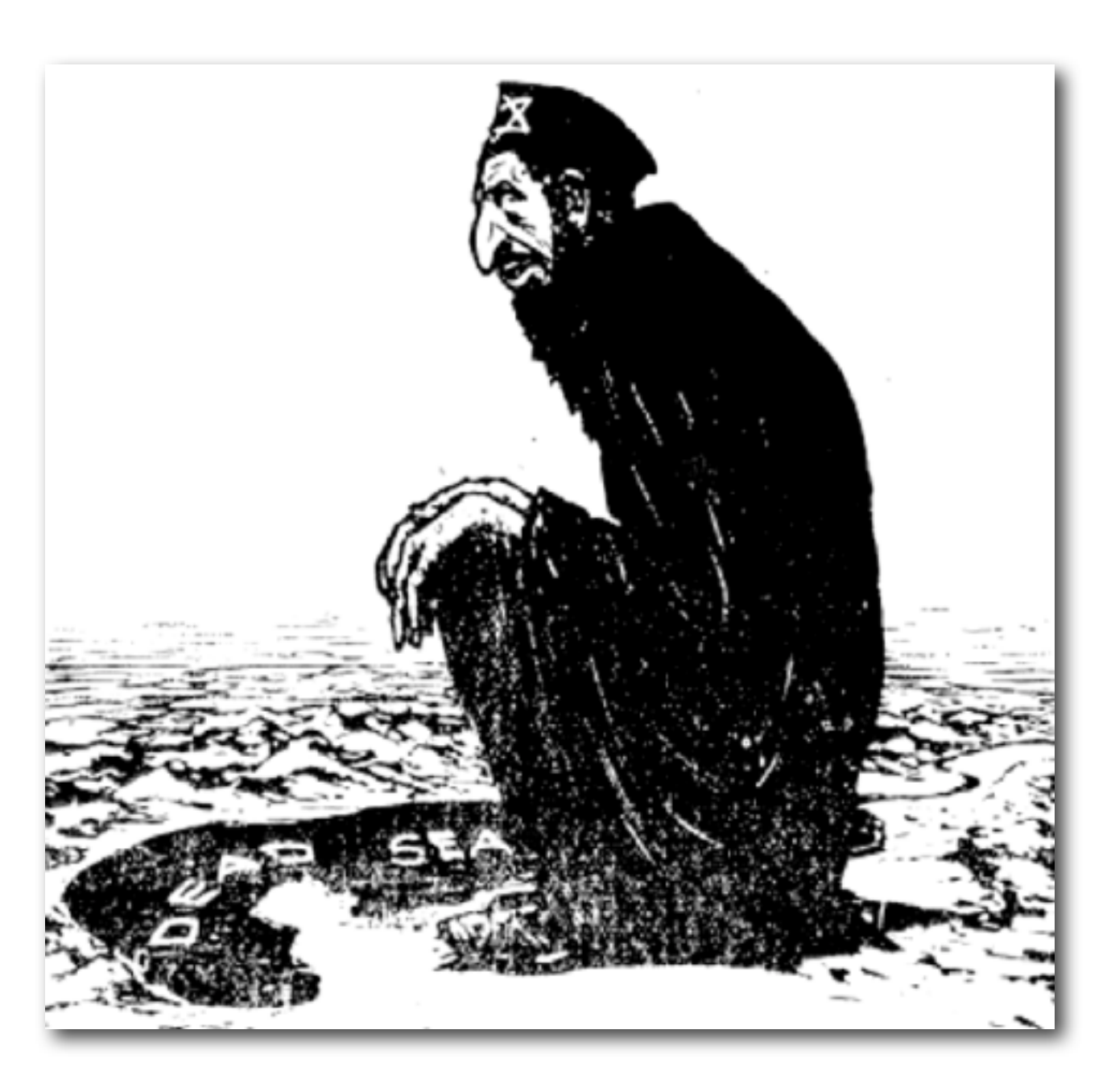
"Yeth, we have no Oil".

[There is lots of Oil in Palestine, but it must not be tapped until the Jews get possession of the country.]