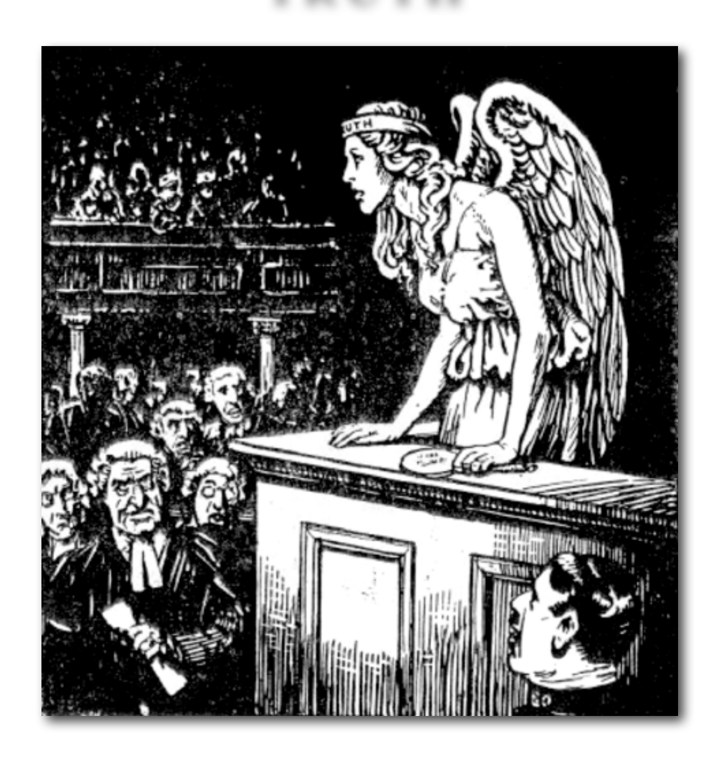
She told the truth about the Jews!

[His Master's Voice; The Judge; "You are a danger to the community, ... err, yes, the community, ... and it is my painful duty..." etc., etc.]