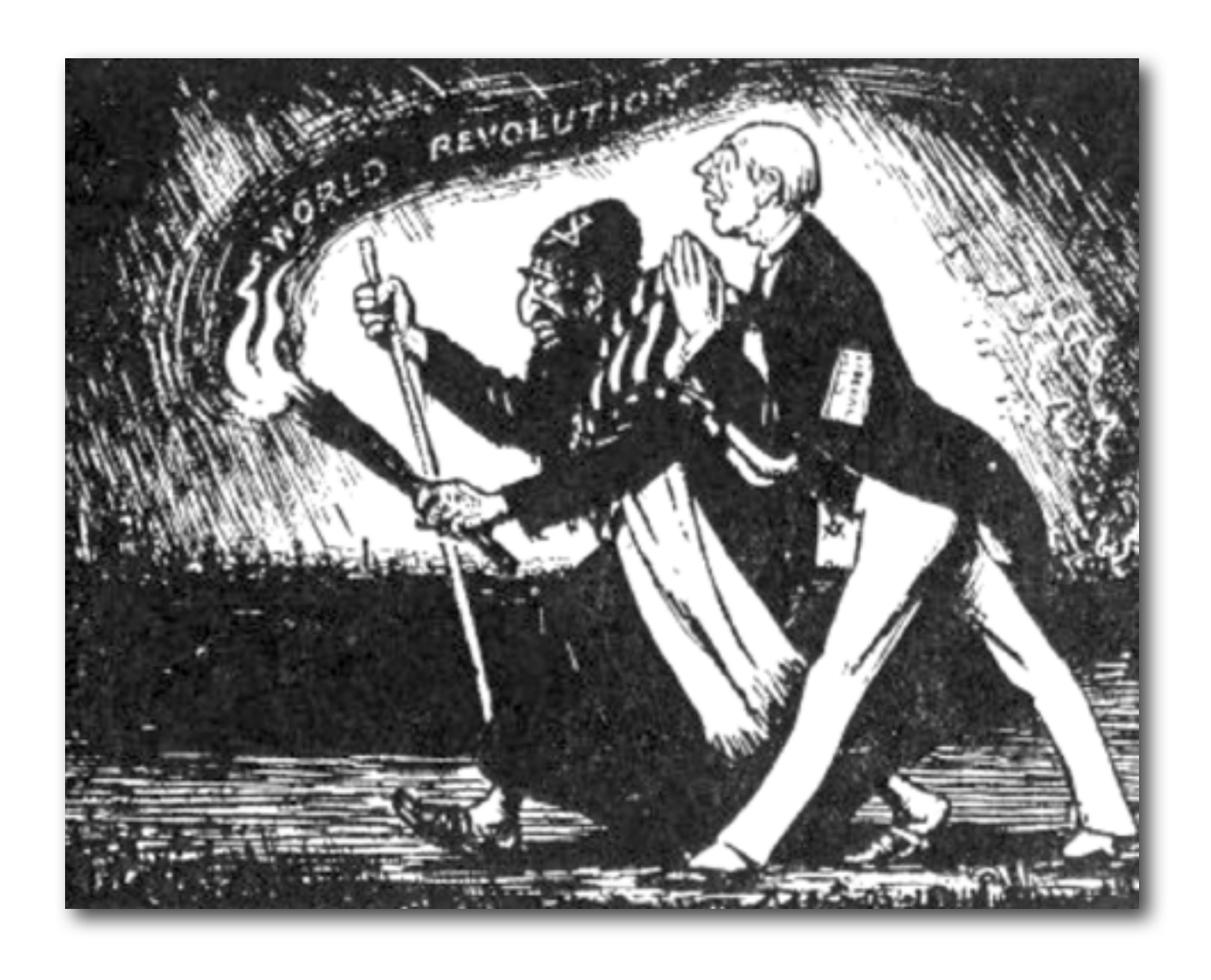
Jewry and Liberalism.