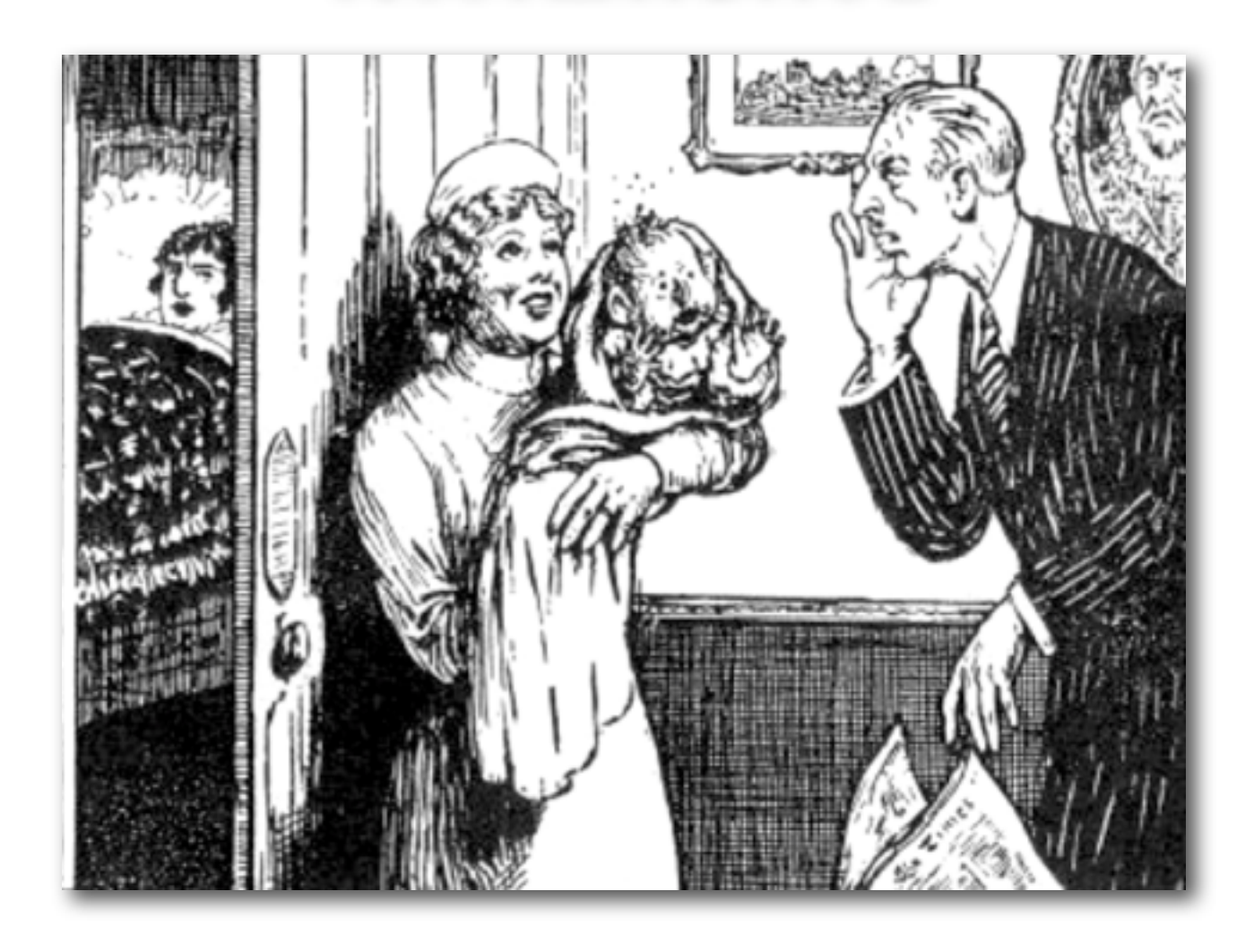
"Don't he take after his mother, my Lord?

This image was first used as the front page illustration of the September 1937 " The Fascist " issue number 100. This edition of the IFL newspaper was largely dedicated to attacking the British aristocracy and the numbers of titled gentry who were marrying wealthy Jewish women.