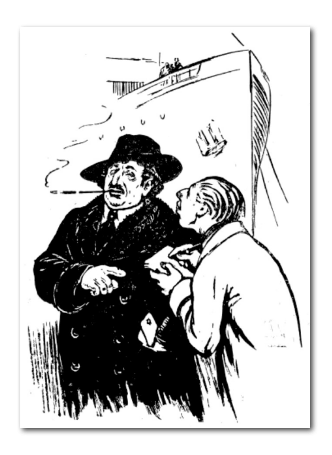
"Tell the Preth* I'm here to make an all-British Film."